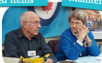
Selkirk Heritage Day