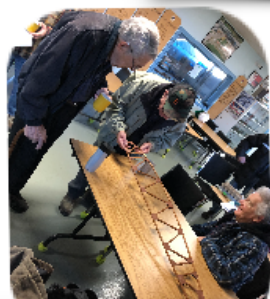
Researching Donated Items