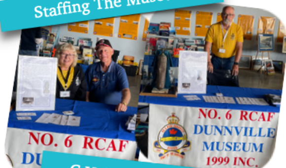
C.H.A.A. Fly In Fly Day