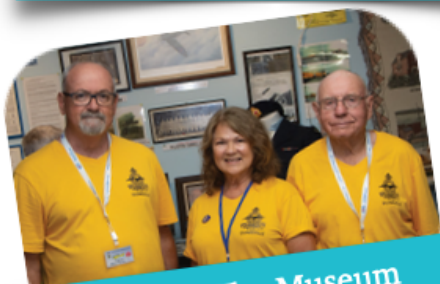
Staffing The Museum