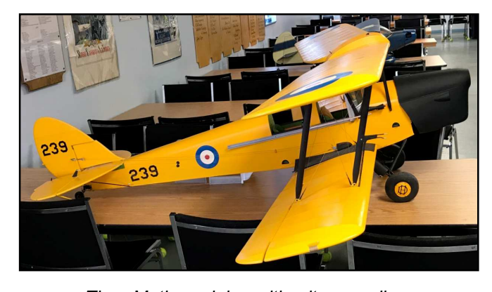
Tiger Moth model awaiting its propeller

A new aircraft model will soon find a place above the library in the meeting room. A 1/12 scale de Havilland Tiger Moth was donated to the Museum by Graham MacDonald - P.Eng. Museum volunteer Ross Watterworth commented: "It's the same scale as the Fleet Finch over the meeting room's front table. It's great to have both of these basic training plane models." The Tiger Moth model is especially exciting as the parts are a very detailed and accurate representation of the aircraft.