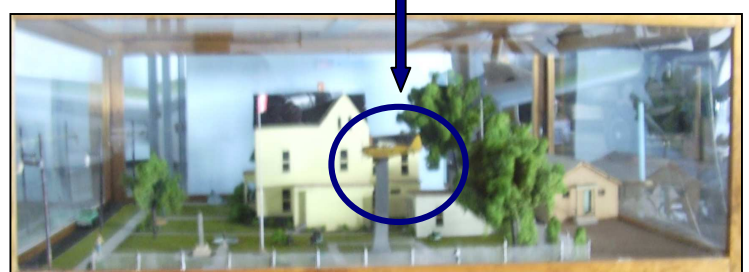
Harvard Memorial shown in model

One of the new exhibits in the Museum hangar is a scale model of the old Town Hall (formerly the home of the Rolston family) and the Harvard memorial, on loan indefinitely from Haldimand County.