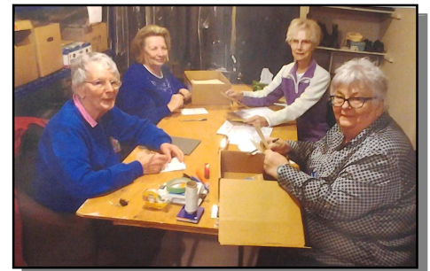
Museum volunteers work on cataloging artifacts.

The Museum's third annual Yard Sale Fundraiser held on the summer season's opening weekend, May 19-21, was a great success! More items were donated than last year and the hangar was full to bursting with all manner of "merchandise"—candlesticks to canoes and everything in between. The sale netted the Museum $4,000. Thanks to the many volunteers who set up the sale, cashiered, and packed up remainders. In addition to funds, the Yard Sale brought more than 130 visitors to the Museum!