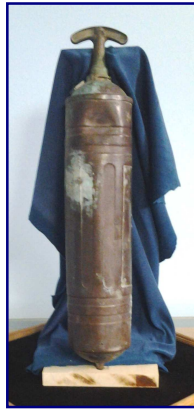
Fire Extinguisher from Harvard #2963